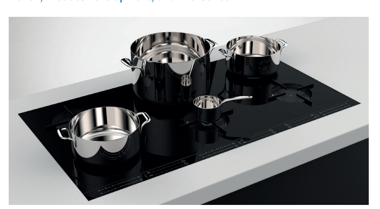
M-Stekio/Burnerway represents a breakthrough in the field of gas cooktops, that are completely re-designed from both technical and aesthetic point of view. M-Stekio/Burnerway is at Metstrade. Amsterdam, 13-15 November 2018, booth 7.248.

3P Engineering was founded in 2002, in Ancona, Italy, winning the "E-capital" Business Competition as an innovative engineering company. With a complete range of IoT-enabled products and services "Industry 4.0", 3P Engineering is an innovative SME that stands out for its know-how and cross skills, in line with the most advanced technological frontier. With the distinctive ability of a competence center, 3P Engineering creates continuous innovation with top performing solutions, such as products and business models of projects selected by the European Commission. 3P Engineering studies and identifies new development opportunities and best practices, interpreting specific needs to translate them into cutting-edge solutions in various market sectors through its four Business Units: Testing Laboratory (accreditated by Accredia, n 1537, UNI CEI EN ISO IEC 17025:2005), Test Bench, Product Development, and Pre-Series.