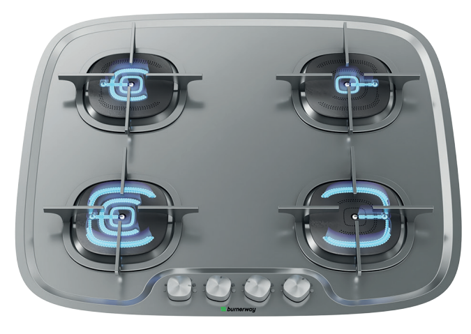
The aesthetic design of M-Stekio/Burnerway has been developed by Politecnico di Milano, one of the top ten universities for industrial design worldwide.

project selected by the European Commission for its innovative scope (the COSME Programme) and 3P Engineering's aim was to collaborate with an academic institution that has international appeal, as is the Politecnico di Milano. The activity carried out by the Design Department is related to the complete development of the aesthetic design of the cooktop, up to the realization of the mockups. M-Stekio was presented as a success case study by 3P Engineering at the Politecnico di Milano last October involving more than 100 designers to disseminate the innovation of the project.